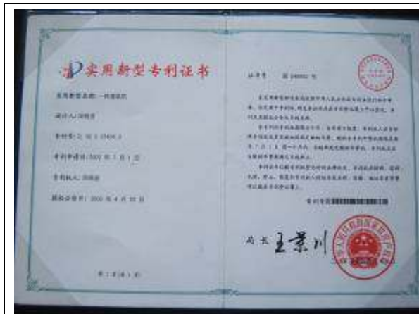
Description: Patent certification