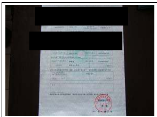
Description: Export License