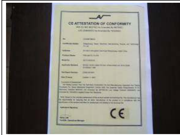
Description: CE certification