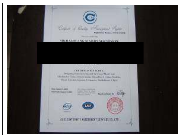
Description: ISO certification