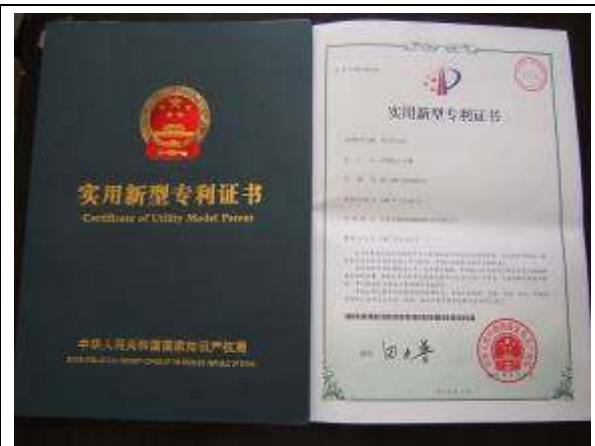
Description: Patent certification