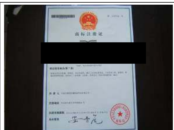
Description: Brand certification

This document is issued by SGS subject to its General Conditions of Service printed overleaf or available on request and accessible at www.sgs.com < http://www.sgs.com > < http://www.sgs.com >. Attention is drawn to the limitations of liability, indemnification and jurisdictional issues defined therein. Any other holder of this document is advised that information contained hereon reflects SGS's findings at the time of its intervention only and within the limits of Client's instructions, if any. SGS's sole responsibility is to its Client and this document does not exonerate parties to a transaction from exercising all their rights and obligations under the transaction documents.