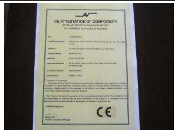
Description: CE certification