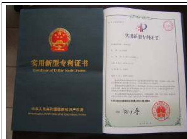
Description: Patent certification