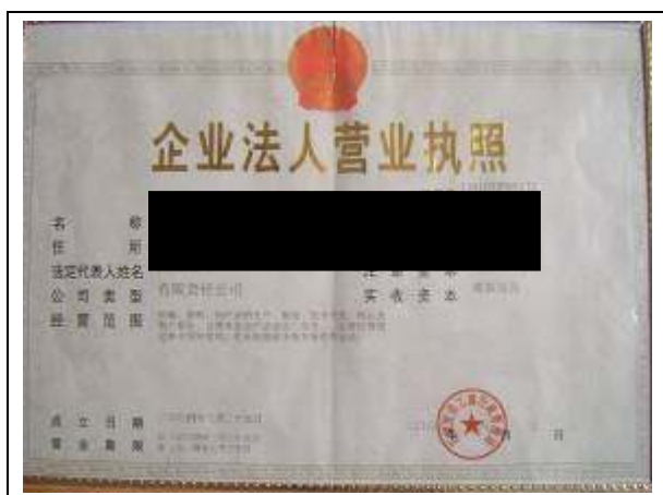
Description: Business License