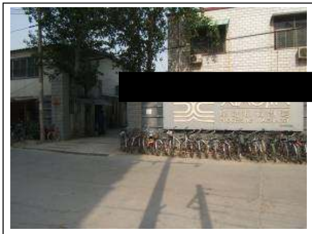
Description: The door of the Company