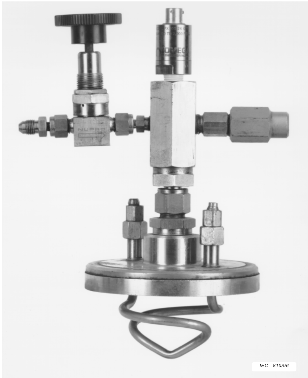
Figure 3 – Condenser coils